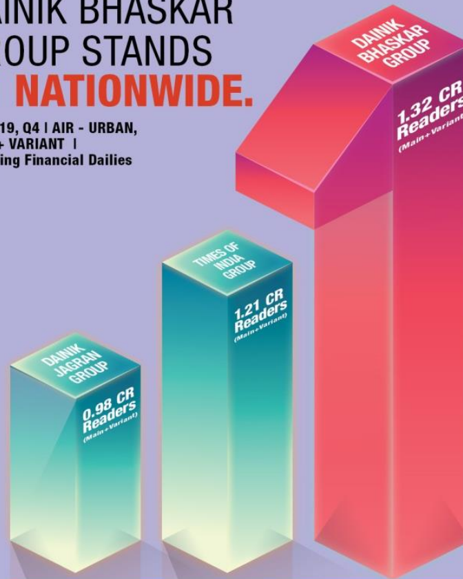
Dainik Jagran Group Times of India Group Dainik Bhaskar Group

IRS 2019, Q4 | AIR - URBAN, MAIN + VARIANT | Excluding Financial Dailies