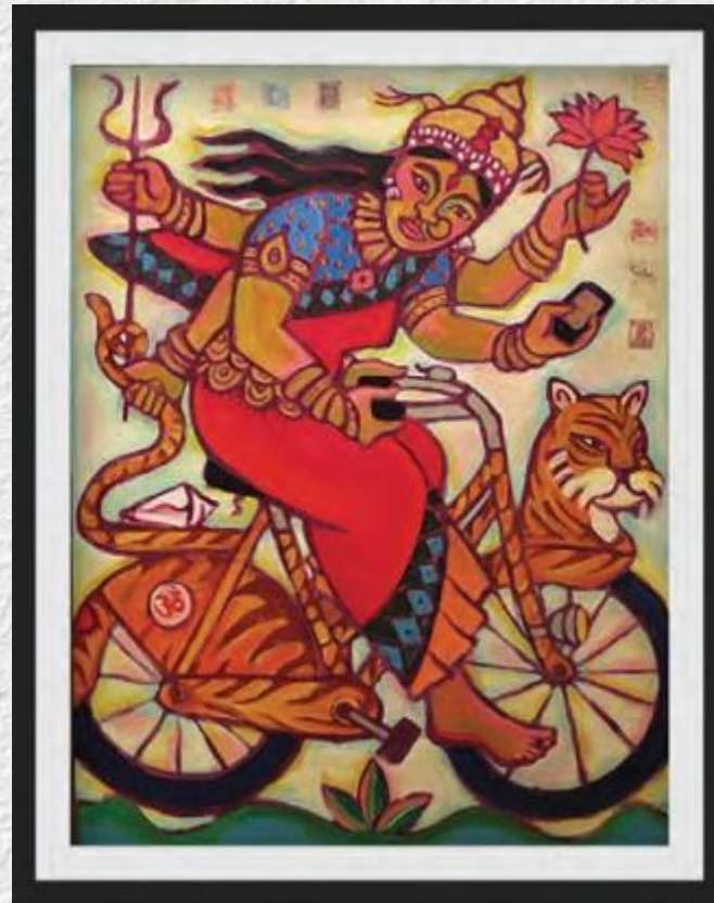
A Painting competition 'How women see today's woman'

Nari Pratibimb - The group executed a brand engagement activity for Kent RO in MP, CG, CPH, Maharashtra, Bihar, Jharkhand, Gujarat & Rajasthan market